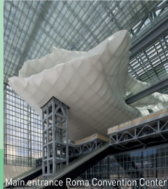
Main entrance Roma Convention Center